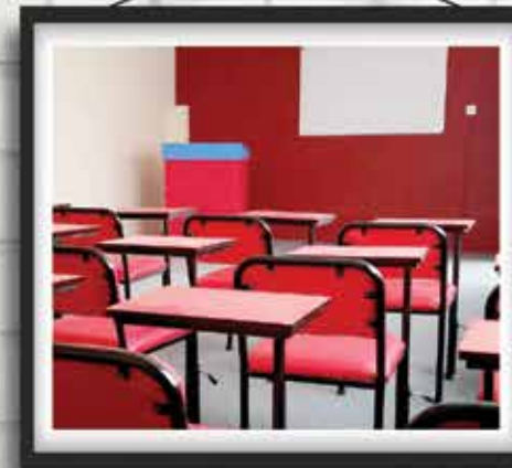
Class Room 1