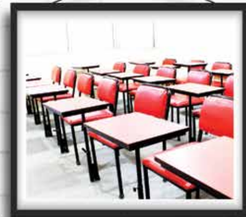
Class Room 3