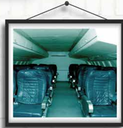
Airplane Mock Up