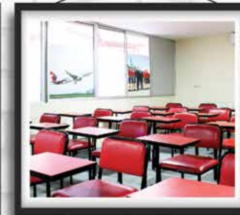
Class Room 2